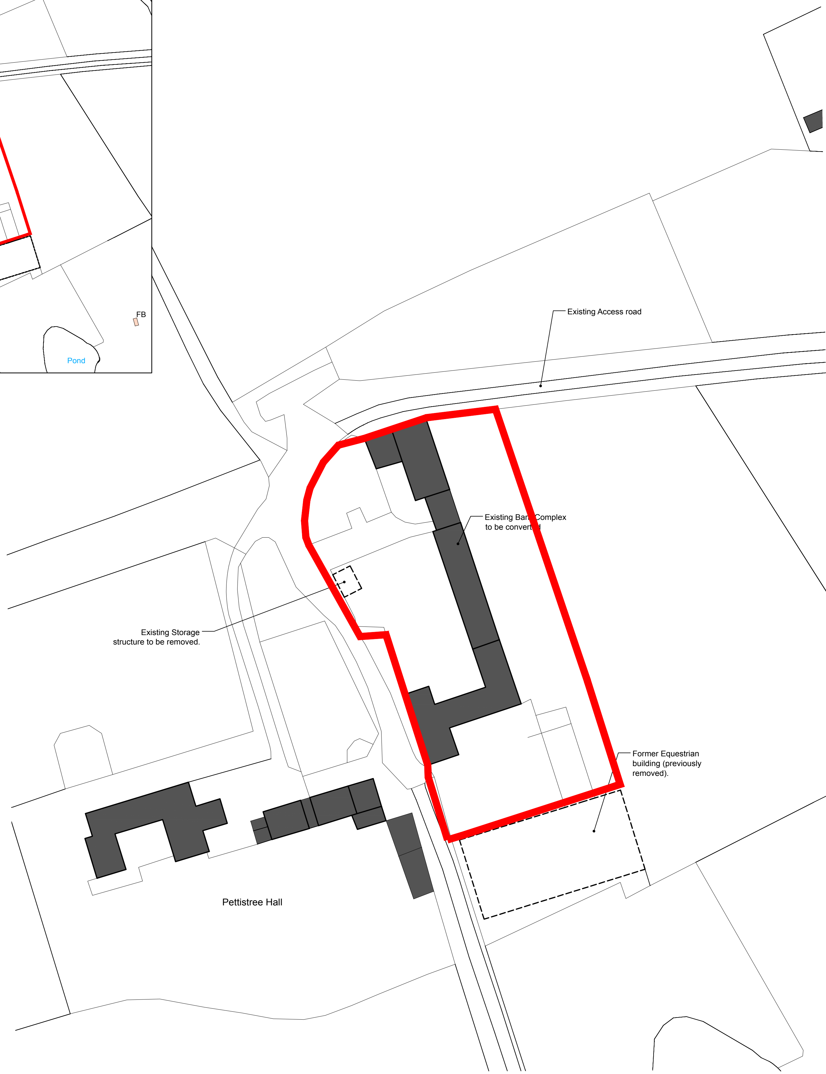
EXISTING SITE PLAN - 1:500